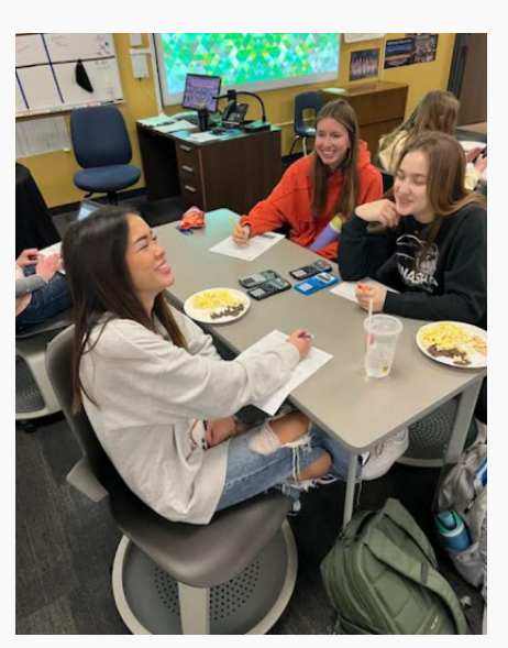
Snacks and problem solving in Flex Fridays